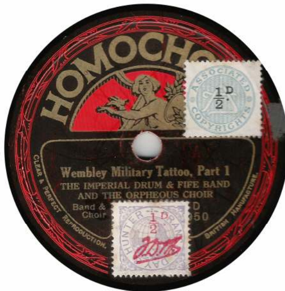
Figure 21. Associated Copyrights type 2 030 1/2d, and Francis, Day & Hunter type 2b 040 1/2d on 1926 Homochord D950

T/S M (on red) Telefunken (on orange-brown)