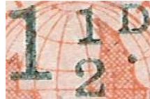
1 1 / 2 d b. missing fraction bar

040 1917-29. Type 2b. Perf 15x14, Font F2. Small signature, large figures of value.