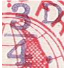
3 / 4 d a. dropped dot below 'D'